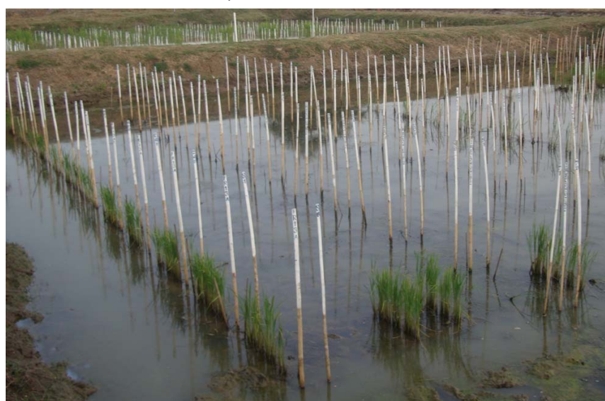
Figure 1. Screening for submegence tolerance at seedling stage in rice from BC_2F_2 population in cross between OM1490 / IR64Sub1

observed for survival percentage under flooded condition. The frequency distribution of % survival in flooded reaction among the BC<sub>2</sub>F<sub>2</sub> was continuous. This showed a good recombination for plant submegence in the population. Out of 125 BC<sub>2</sub>F<sub>2</sub> progenies from the selected ones, plant # 125 was selected based on its possession of the Sub1 locus and maximum recipient genome, with a similar size of Sub1 introgression as the first version of OM1490 IR64 Sub 1.