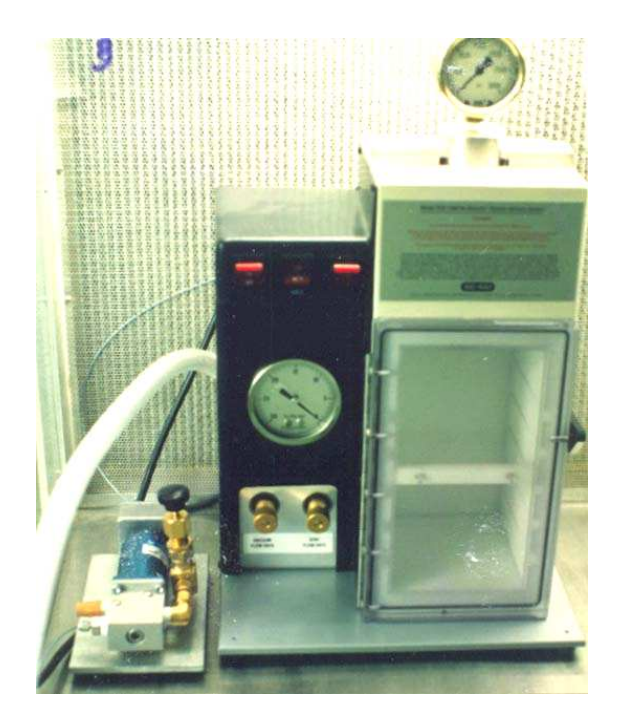
Fig 1: Micro projectile bombardment facility (BIORAD)

pDM803), an optimal condition for DNA, particle concentration and stable transformation events need to be further studied.